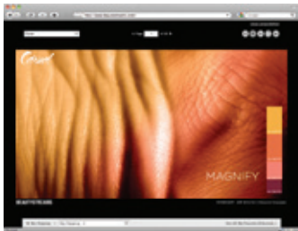
Colors & Concepts