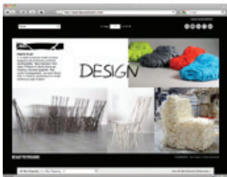
Cross Currents monthly