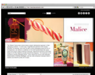
Trade Shows monthly