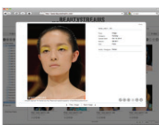
Creative resources portfolios